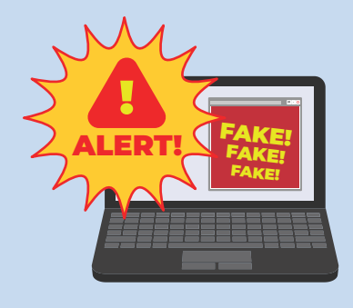
Always exercise caution on the Internet and social media as there may be much misinformation about drugs.