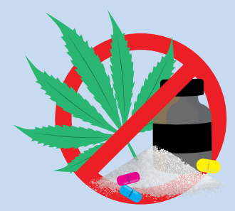
Stay away from drug and inhalant abuse. Walk away if anyone tries to offer you drugs.