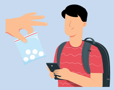
Consuming drugs outside of Singapore, even if the drug is legal in that country is an offence liable for the same punishments imposed upon such offences committed in Singapore.